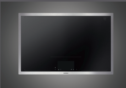
30" Vario 400 series full surface induction cooktop For those of unlimited imagination