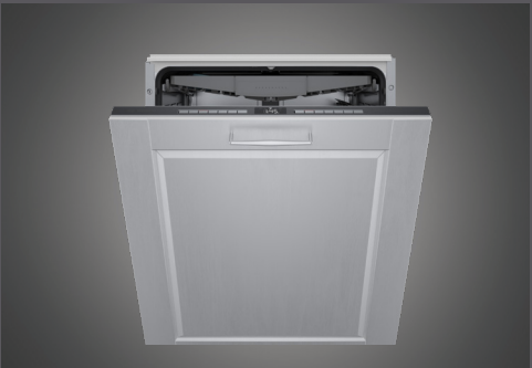
Bosch 24" 800 series dishwasher ADA-compliant dishwasher