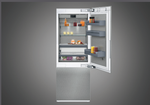
30" Vario 400 series two-door bottom freezer Residences 05, 06, 10, 11