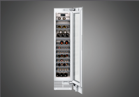
18" Vario 400 series wine climate cabinet Residences 00, 01, 03, 07, 09, 12