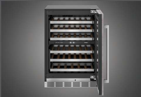
Thermador 24" Freedom® beverage center with glass door Residences 02, 05, 08, 11, 13