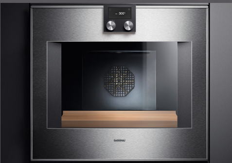
30" 400 series oven Cook with intense heat, without feeling it