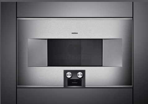
30" 400 series Combi-microwave oven Save your time and make your food tastier