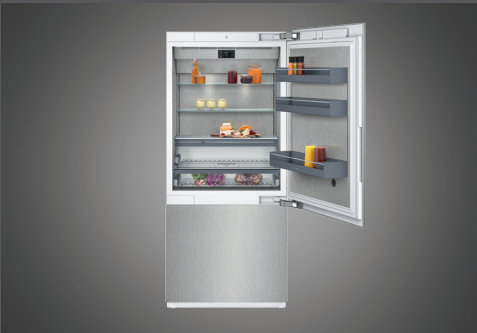
36" Vario 400 series two-door bottom freezer All residences except 05, 06, 10, 11

Extending the freshness of your ingredients and presenting all in its best light